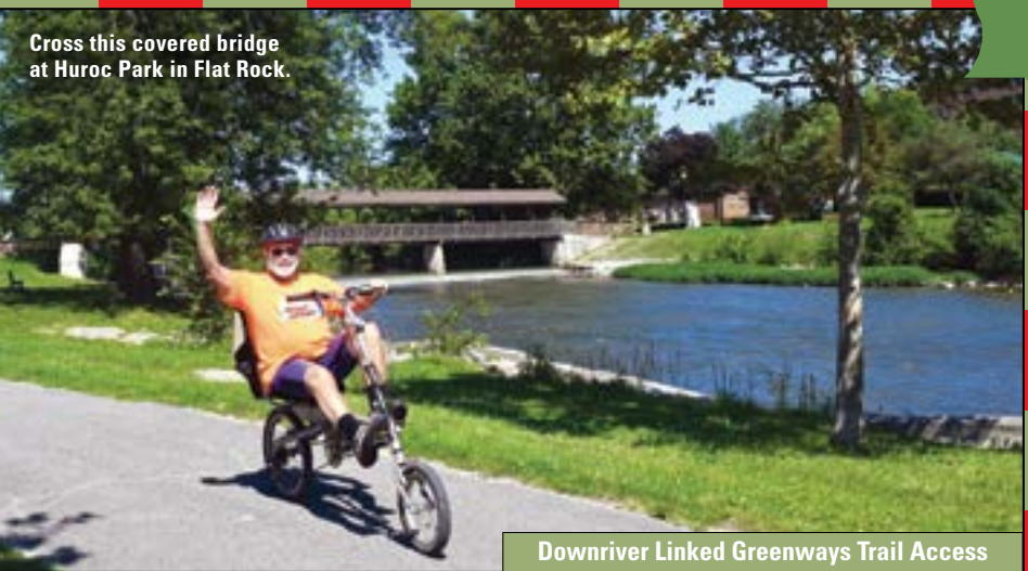
Cross this covered bridge at Huron Park in Flat Rock.